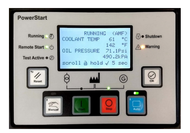
PowerStart 600 control operator/Display

Note: Please, refer to PS0600 product literature for additional Information on Control System.